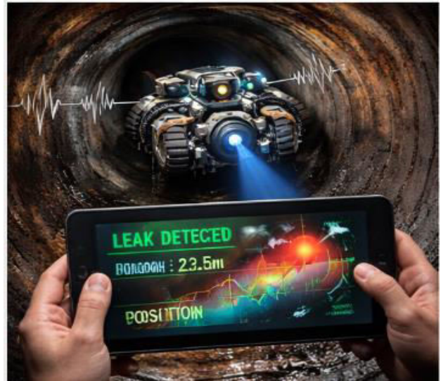
Fig 6.3: Leak Detection and Data Visualization