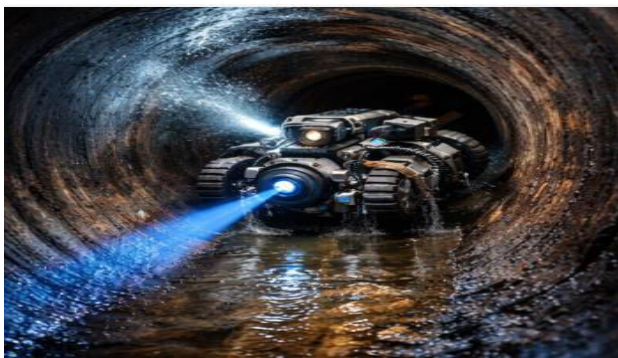
Fig 6.2: Autonomous Navigation Inside Pipeline