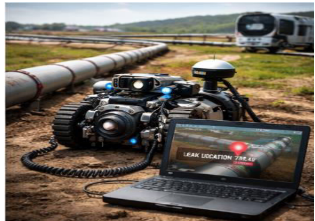
Fig 6.4: Leak Localization and Monitoring System