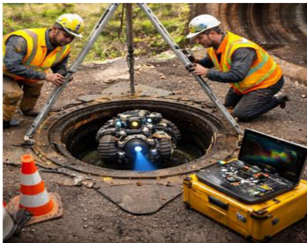
Fig 6.1: Robot Deployment into Pipeline